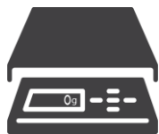
Weigh in Grams

Set the scale to measure in grams (g) and make sure the display shows a zero.